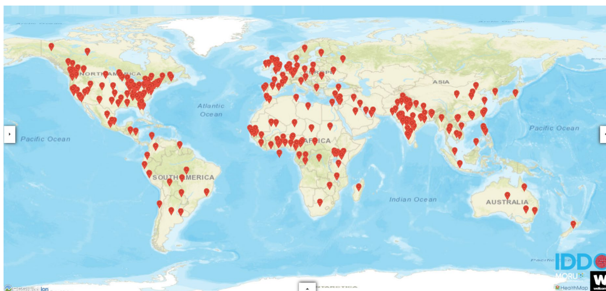
Figure 1. Incidents on poor quality medicines and medical products from January to October 2020 linked to COVID-19.

THIS IMAGE WAS GENERATED WITH THE MEDICINE QUALITY MONITORING GLOBE USING COVID-19 (AND SYNONYMS) AS SEARCH TERMS . IT INCLUDES INCIDENTS IDENTIFIED BY THE SYSTEM IN ENGLISH, FRENCH, VIETNAMESE, MANDARIN AND SPANISH LANGUAGES.